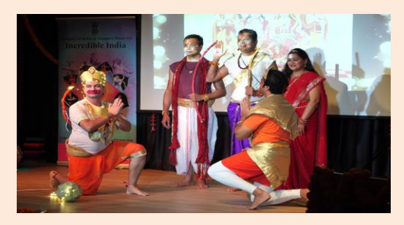
Ramleela presented by members of Indian Community